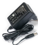
24 V 0.8 A power adapter