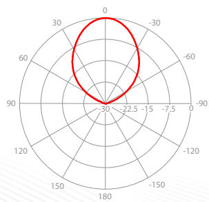
V/H - Port Pattern Azimuth 5.6 GHz