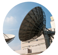
Leased Line Replacement