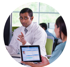
Primary or Redundant Connectivity