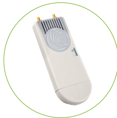
ePMP 1000 GPS Sync Radio