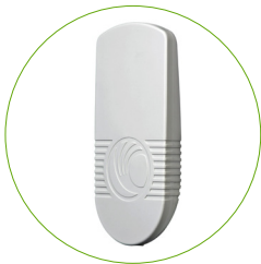
ePMP 1000 Integrated Radio