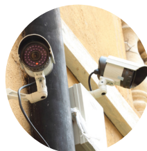
Video Surveillance Backhaul