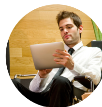
Remote Office Connectivity