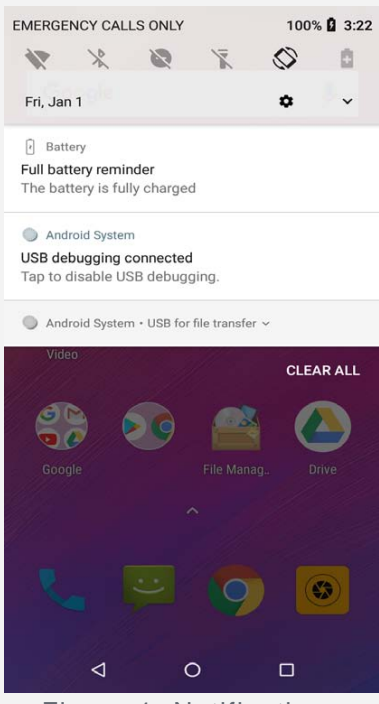
Figure 1: Notifications

The Notifications panel (see Figure 1: Notifications) informs you of missed calls, new messages, and activities in progress such as file downloading. The Quick Settings panel (see Figure 2: Quick Settings) allows you to access frequently-used settings such as the Wi-Fi switch.