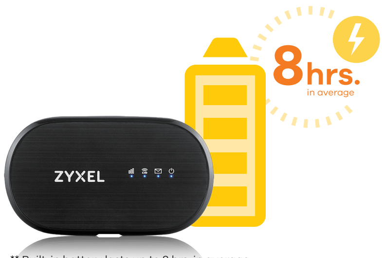
** Built-in battery lasts up to 8 hrs. in average. (Depends on network environment.)

extend service time with fresh ones. Rather than the usual lithium-ion batteries, the thoughtful design employs lithium polymer batteries that withstand higher temperatures for better safety.