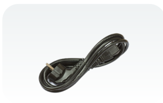
2 Power cords