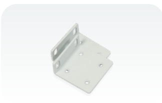
Rackmount bracket white